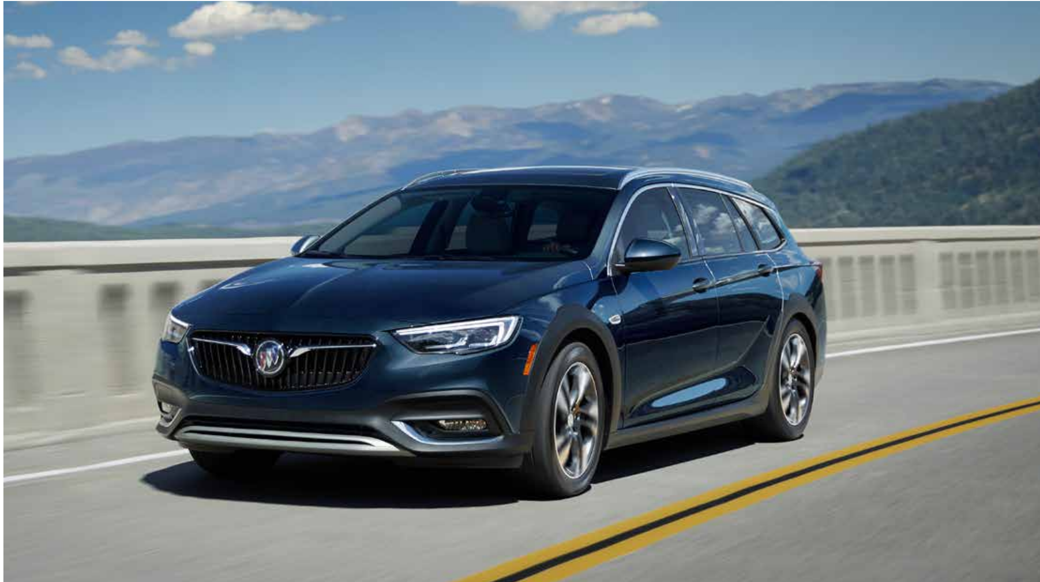
Regal TourX Essence shown in Dark Moon Blue Metallic with available features.