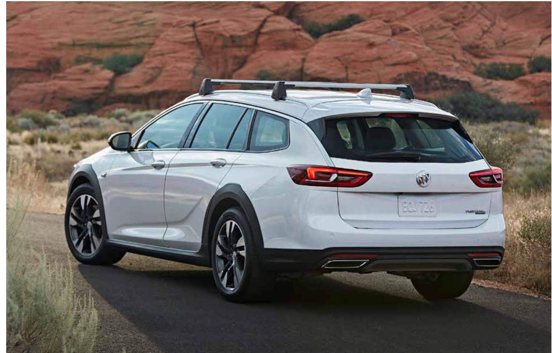
Regal TourX Essence shown in Summit White with available features and dealer-installed accessories.

1 Read the vehicle Owner's Manual for important feature limitations and information.