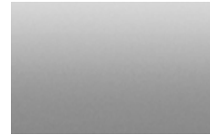
Quicksilver Metallic 3

1 Not available on TourX (1SV). Additional charge; premium paint.