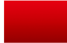
Sport Red 2