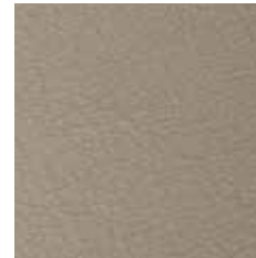
Shale Cloth 6 or Leather-Appointed Seating 5

4 Not available on TourX (1SV). Available on Preferred.