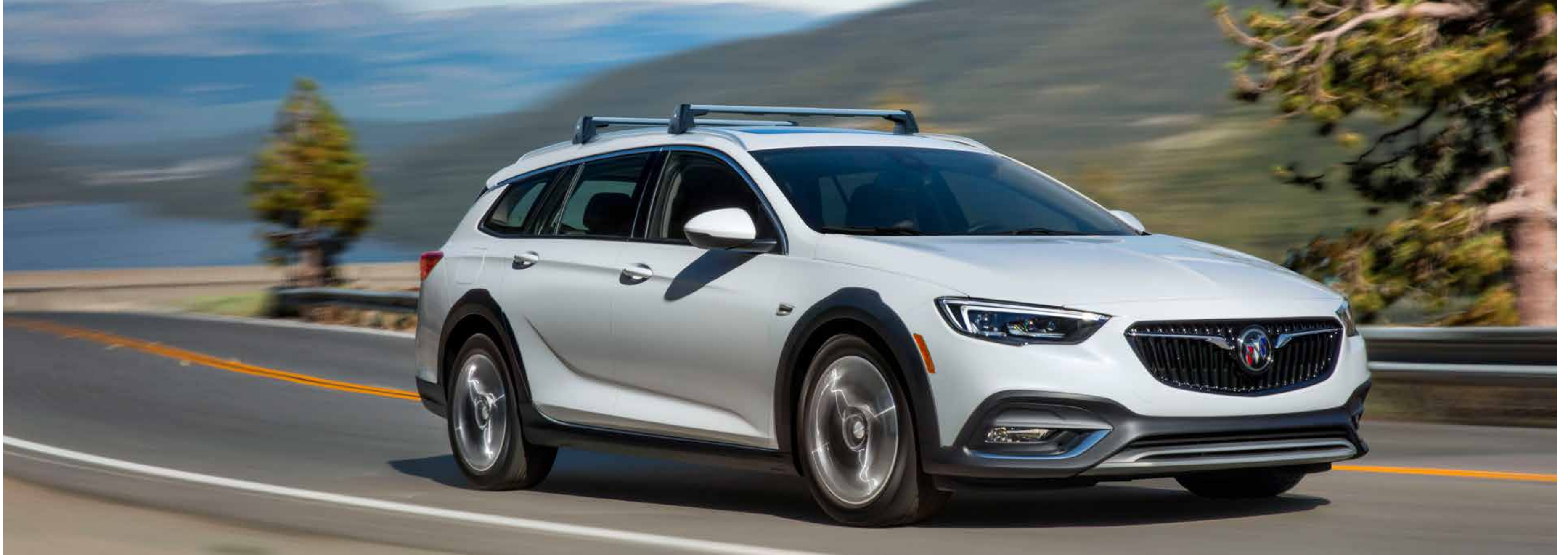
Regal TourX Essence shown in Summit White with available features and dealer-installed accessories.