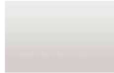
White Frost Tricoat 1