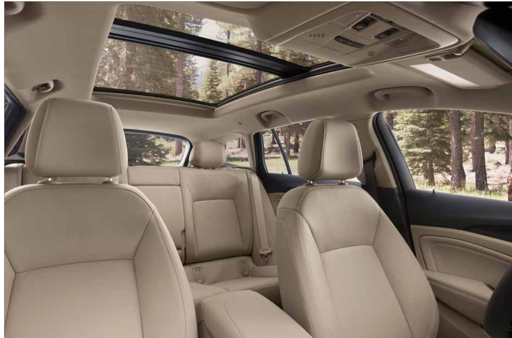
Regal TourX Essence interior shown in Shale with Ebony accents and available features.

DUAL-ZONE CLIMATE CONTROL The standard dual-zone automatic climate control system allows the driver and front passenger to personalize the temperature on their side of the cabin.