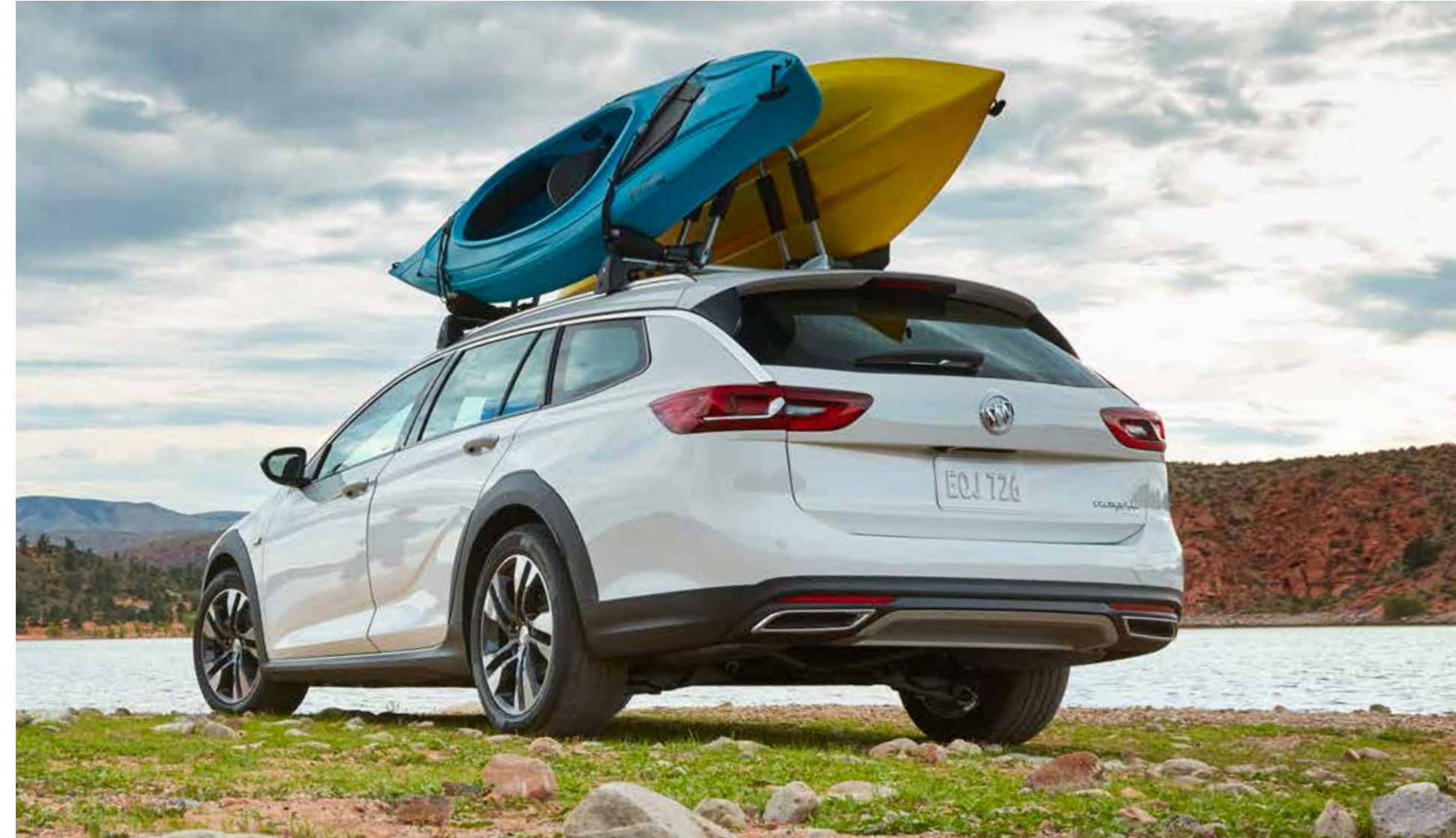
Regal TourX Essence shown in Summit White with available features and dealer-installed accessories.