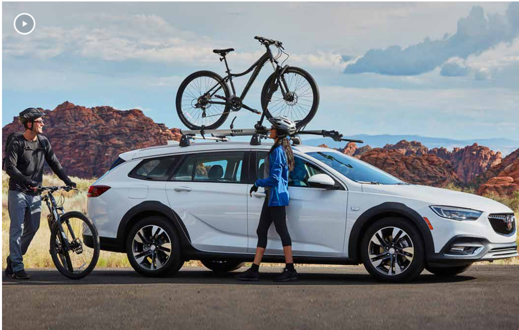
Regal TourX Essence shown in Summit White with available features and accessories including Thule® Side-Arm Bike Carrier.